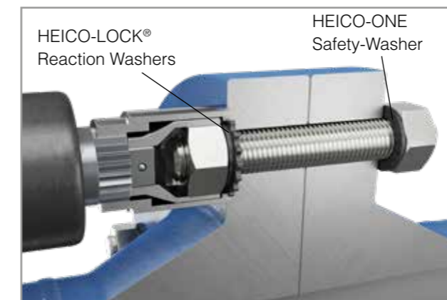
Use of HEICO-LOCK® Reaction Washers and HEICO-ONE Safety-Washer in a through-hole.

The bolted joint is tightened from the active side. Additional locking with a wrench by a second person or with the help of special tools is no longer necessary thanks to the use of the HEICO-ONE Safety-Washer.