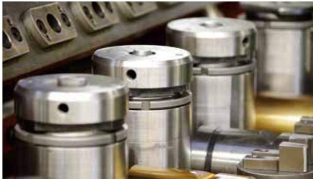
tool construction and manufacturing