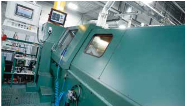
metal forming up to 6 stages with preheated materials