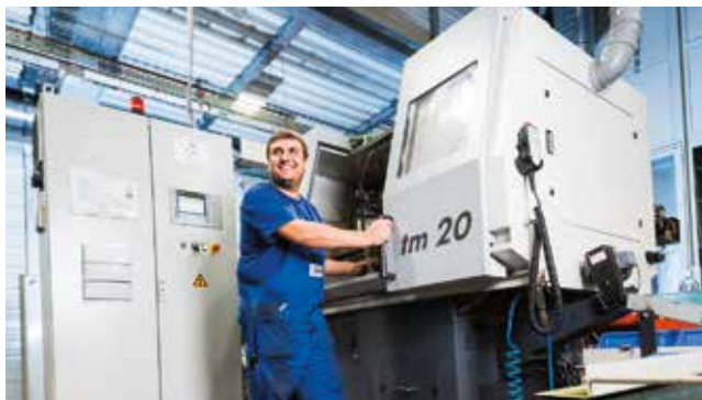
modern machining technologies